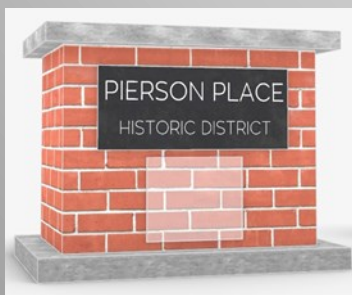
7 th Ave & Highland