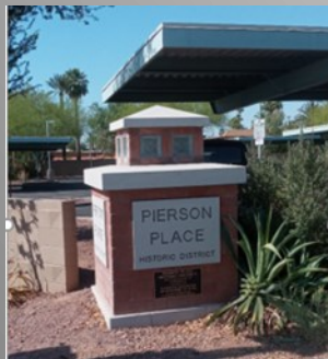
3 rd Ave & Camelback

We are building another monument marker at 7 th Ave & Highland. It will be red brick with a concrete cap, similar to the ones at 3 rd Ave & Camelback and Central & Highland. Pretty soon, we will have markers on three of our borders, and then we'll start on the fourth! Many thanks to the neighbors who helped us pull it off. Look for a roasting ceremony when it is installed!