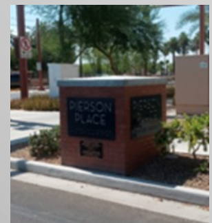
Central & Highland

This newsletter is funded by a Block Watch grant provided by the City of Phoenix. Many thanks to the Block Watch folks at the Phoenix Police Department for administering this crime fighting program!