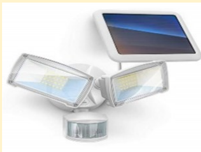
Camelback Rd (from 7 th to Central Ave)